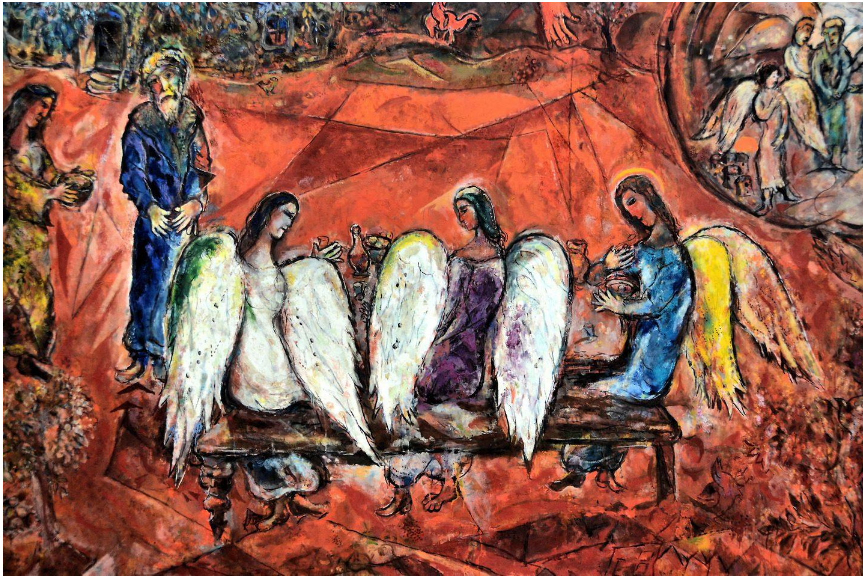
Mac Chagall, Abraham and the Three Angels, 1960-66 (Marc Chagall Museum, Nice)