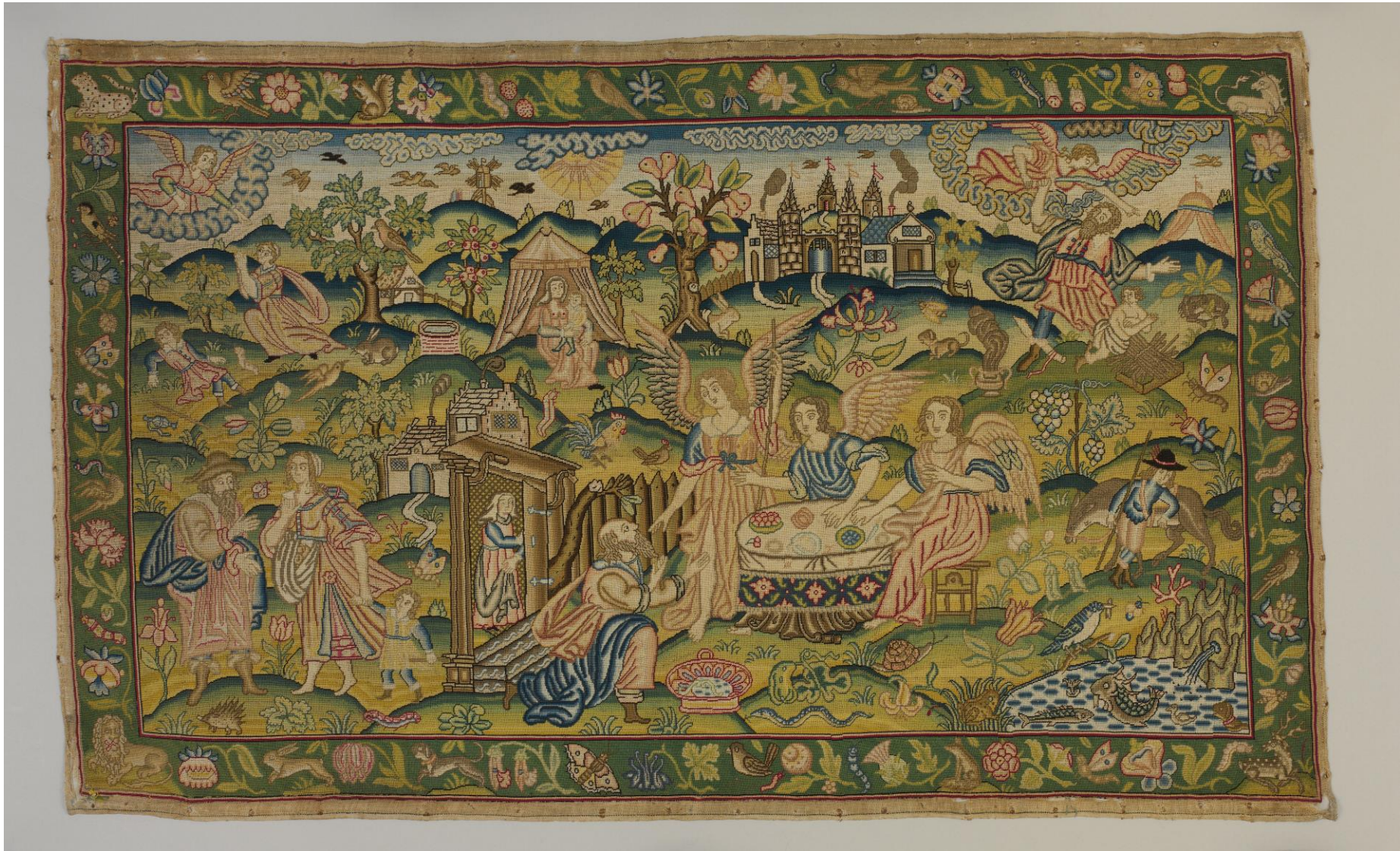
Anon. British, The Life of Abraham Tapestry, 17 th century (Metropolitan Museum of Art, NY)