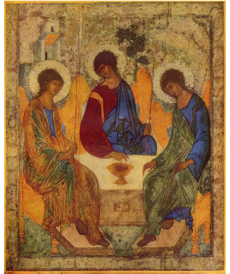
Andrei Rublev, The Trinity (The Hospitality of Abraham), 15 th century Anon, The Oak of Mamre (Abraham's Oak), Hebron, c.1870 (V&A)