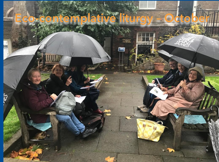
Eco-contemplative liturgy - October