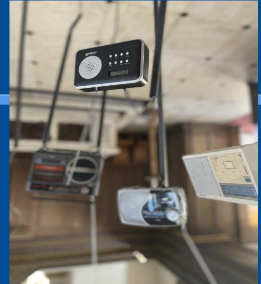
Jesse Darling: Miserere - October 2022