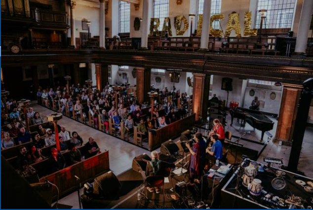
Embark - September