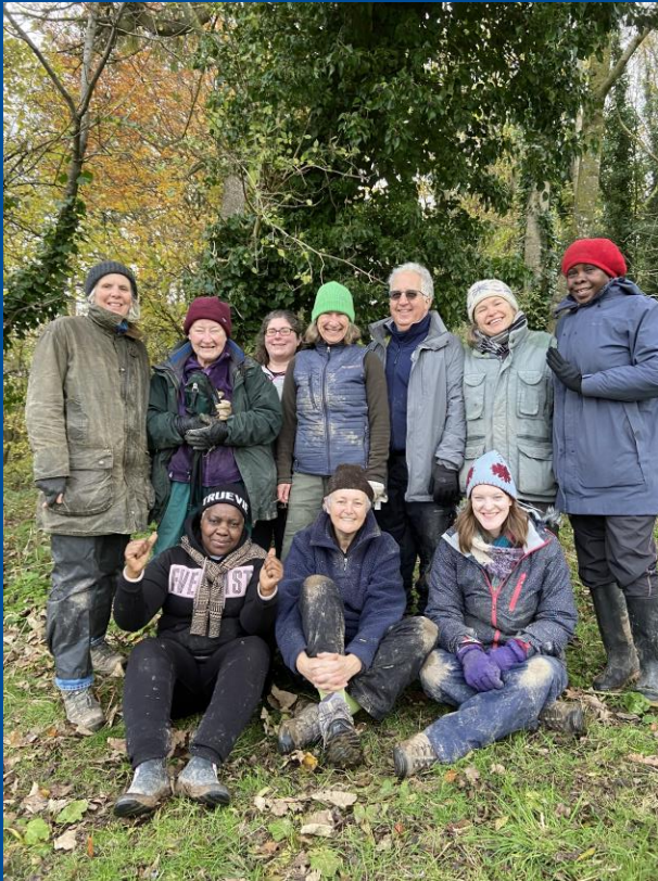
Hedgerows - December