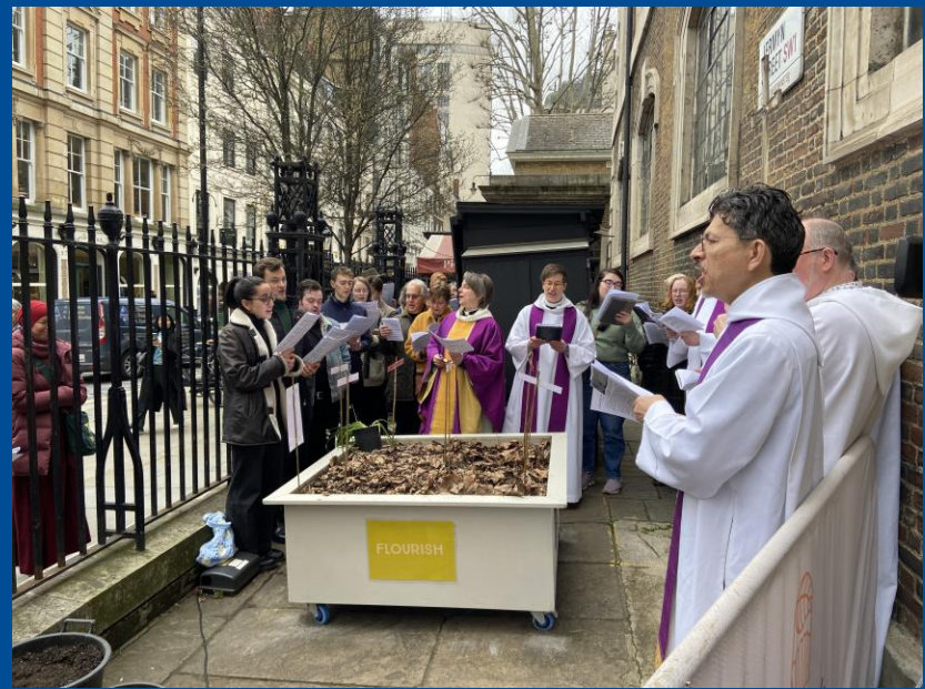
Eozoic planting day - March