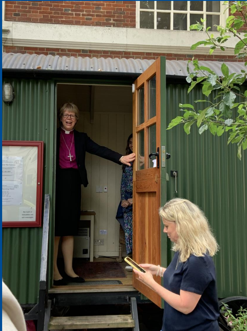
Bishop of London visits the Caravan - June 2022