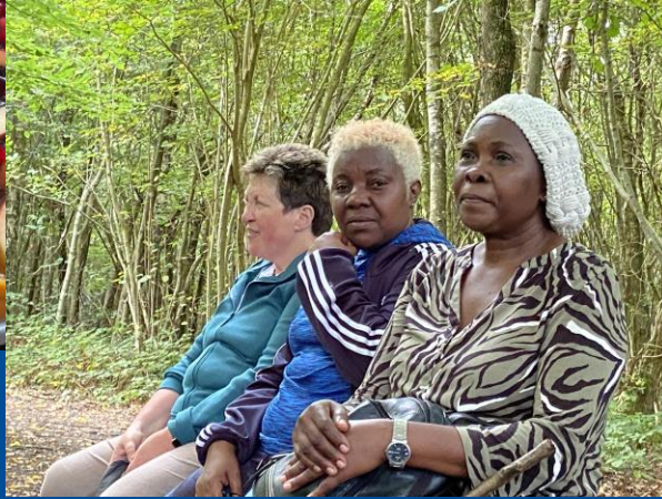
Wassail - January 2023