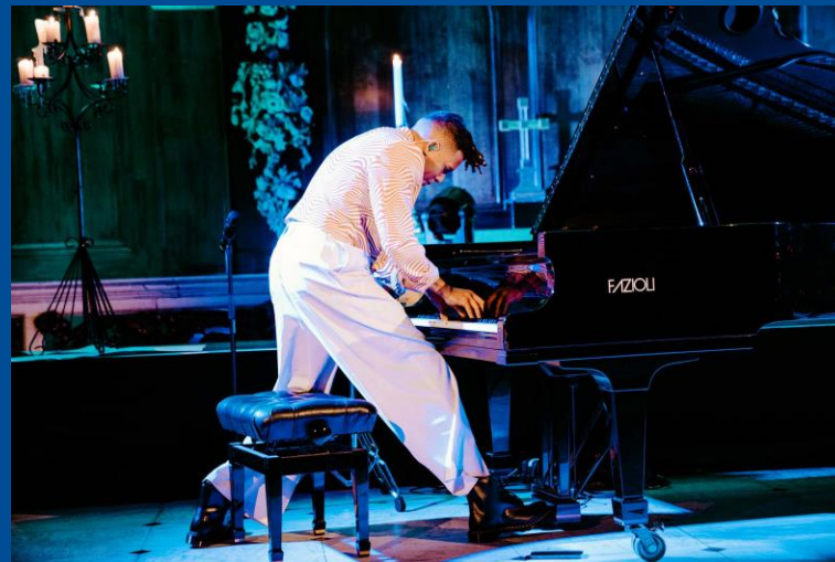
Piccadilly Piano Festival - February 2023