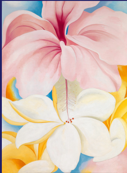
SUMMER 1939. Hibiscus with Plumeria. Georgia O'Keefe.