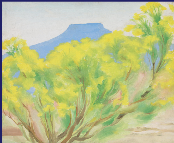
SPRING 1948. Cottonwood and Pedernal. Georgia O'Keefe.