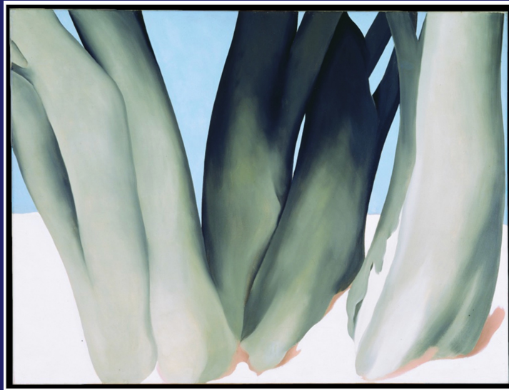
WINTER 1946. Bare Tree Trunks with Snow. Georgia O'Keefe.