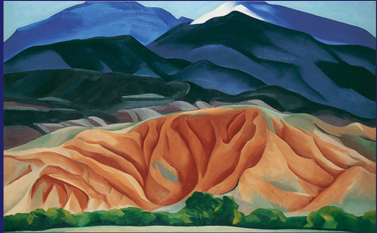
Georgia O'Keeffe (1887-1986).