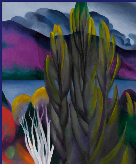
AUTUMN 1921. Georgia O'Keeffe. Lake George With White Birch.