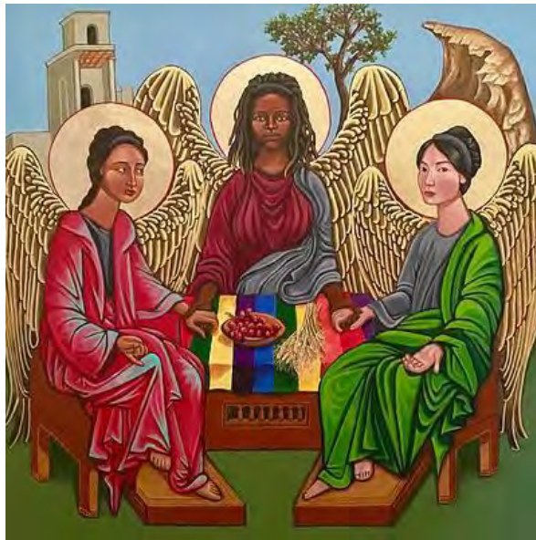
Kelly Latimore - The Trinity